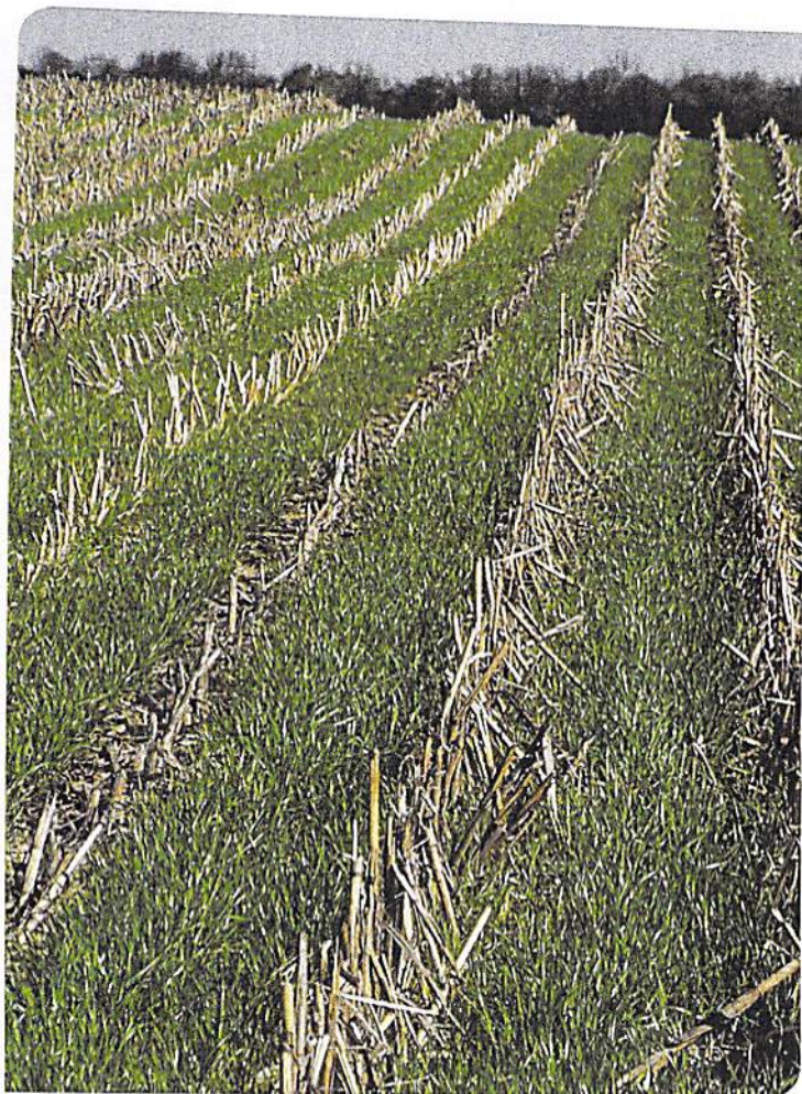
Cover crop planted into no till.