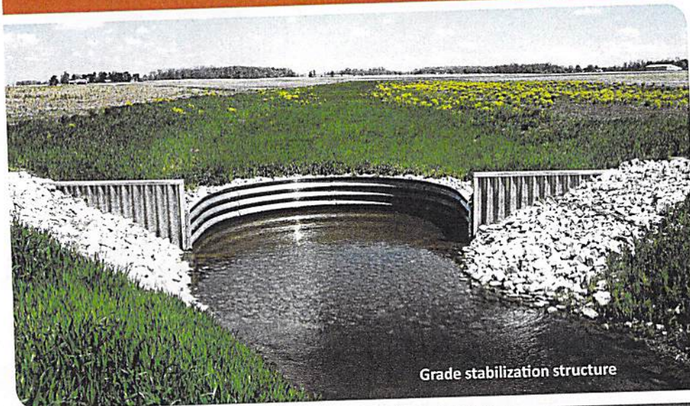
Grade stabilization structure

The Environmental Quality Incentives Program (EQIP) provides financial and technical assistance to farmers to address natural resource concerns and deliver environmental benefits, such as improved water and air quality, conserved ground and surface water, reduced soil erosion and sedimentation, or improved or created wildlife habitat.